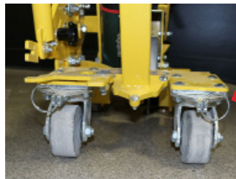
Crack Chasing Mode unlock as shown