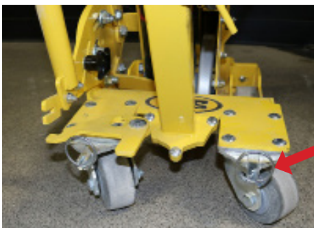
Crack Chasing Mode unlock as shown