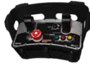
Wireless Remote Included