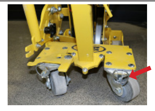
Crack Chasing Mode unlock as shown